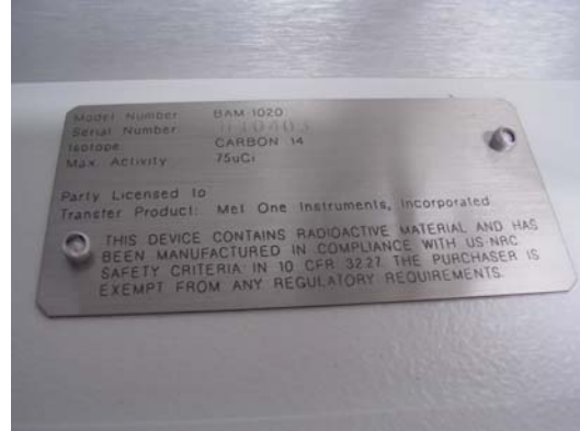
Instrument NRC Tag