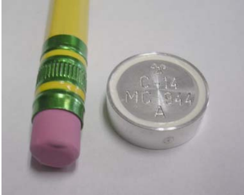
VZ-623 Sealed Beta Source